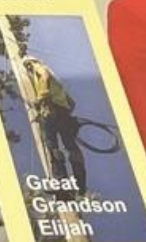
Great Grandson Elijah